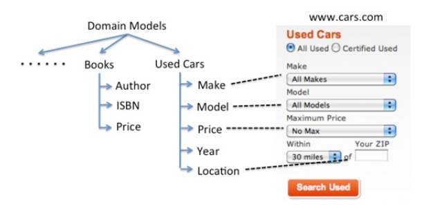
Figure 3 Mappings between domain models and form inputs can be used to automatically fill out HTML forms.

web-form is being matched to a model of user data that is stored in the browser. The user expects the browser to make a best-effort attempt at filling in personal details, which the user confirms before submitting the form for processing.